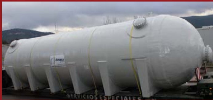
Filters tank Horizontal sand