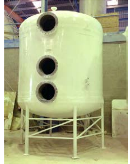
Filters tank Vertical sand