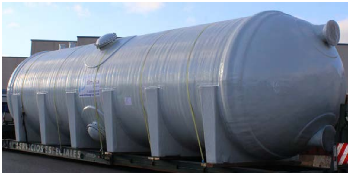
Filters tank Horizontal sand