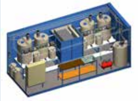
Interior 3D view of the Physical - Chemical Treatment Container

Eliminating all potential water contaminants by physical separation (bars roughing, mesh filters, filter beds) and chemical (adding coagulants and flocculants for precipitation and settling of suspended solids, and other minor dissolved in colloidal form).