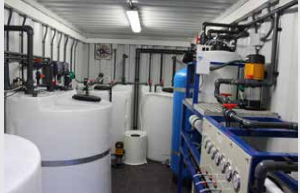
Interior of the Reverse Osmosis container