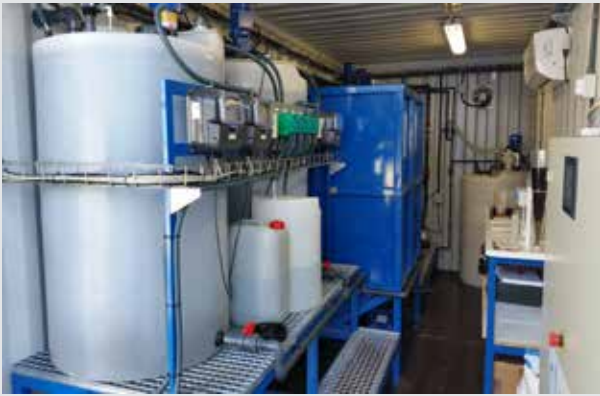
Interior of the Physical - Chemical container

We propose a comprehensive system in three phases : Pretreatment or primary roughing, physical-chemical treatment, and a combined treatment of Membranes (Ultrafiltration, Nanofiltration and Reverse Osmosis). The development of these membranes are the result of years of research, and are made exclusively for Dimasa Grupo equipments .