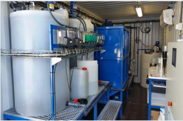
Interior of the Physical - Chemical container

We propose a comprehensive system in three phases : Pretreatment or primary roughing, physical-chemical treatment, and a combined treatment of Membranes (Ultrafiltration, Nanofiltration and Reverse Osmosis). The development of these membranes are the result of years of research, and are made exclusively for Dimasa Grupo equipments .