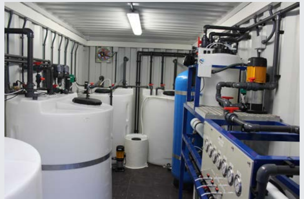
Interior of the Reverse Osmosis container