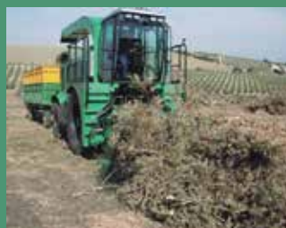
Biogas from agricultural waste