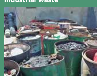
Biogas from Industrial waste