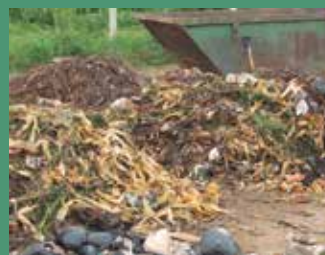
Biogas produced from Municipal solid waste landfills