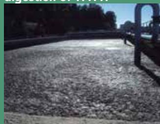
Biogas from sludge digestion of WWTP