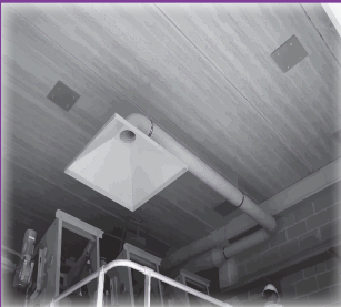
Bell gas extraction