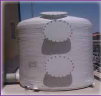
Made GRP single or double bed