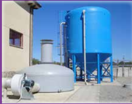
Deodorizing equipment 7000 m3 / h